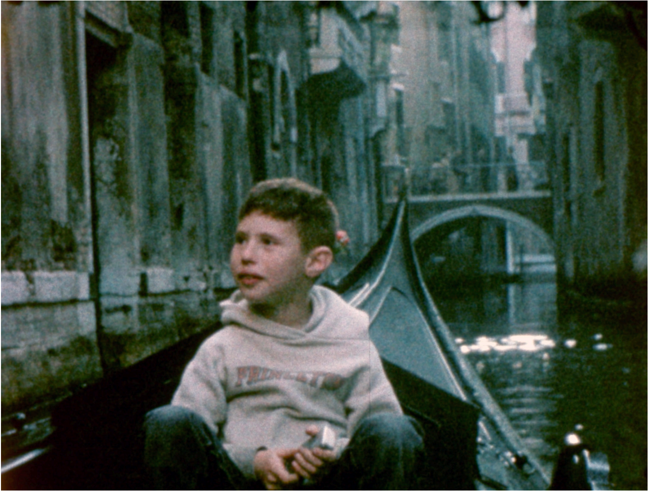
Film still: Beder Family Films collection