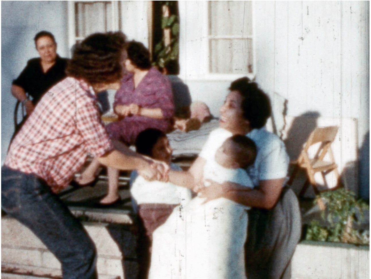
Film still: Sanchez Family of New Mexico collection

(*All images in this document are subject to copyright laws)